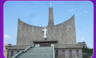
St. Joseph Cathedral Church