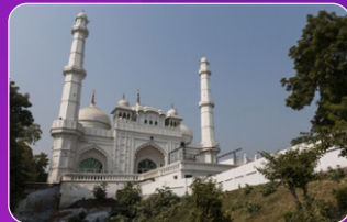
Teele Wali Masjid