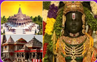
Ayodhya Shree Ram Mandir