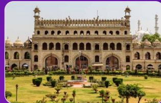
Bhulbhulaiya with Imambada