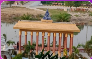
Hanumant Dham Mandir